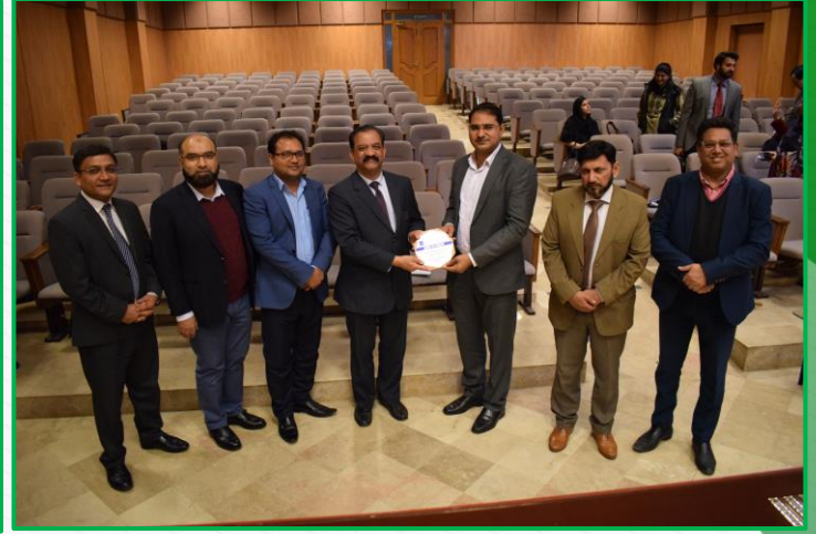
President ICMA & Chairman TSPD Committee was the Guest of Honor at Annual Get-together by UK Branch Council where he apprised the members regarding the activities of ICMA, particularly of TSPD Committee & his meetings with dignitaries to promote the profession in the country & abroad