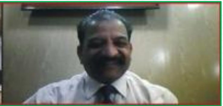
Honorary Secretary visited UAE Branch Council and had a technical session with the members and practicing members of UAE