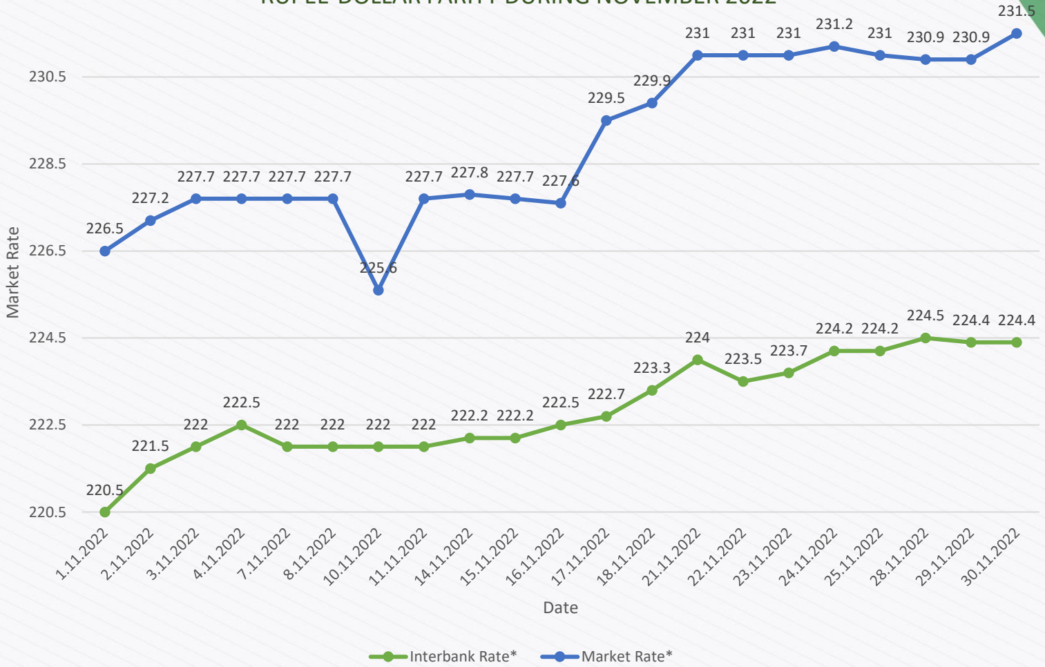
RUPEE-DOLLAR PARITY DURING NOVEMBER 2022