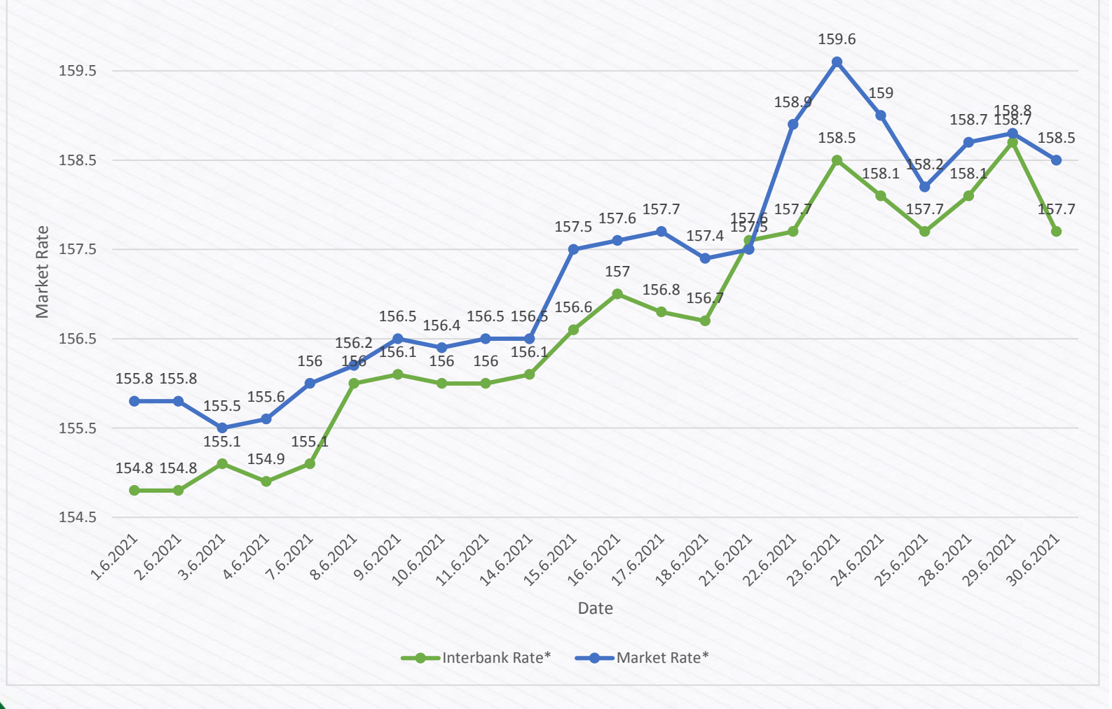
RUPEE-DOLLAR PARITY DURING JUNE, 2021