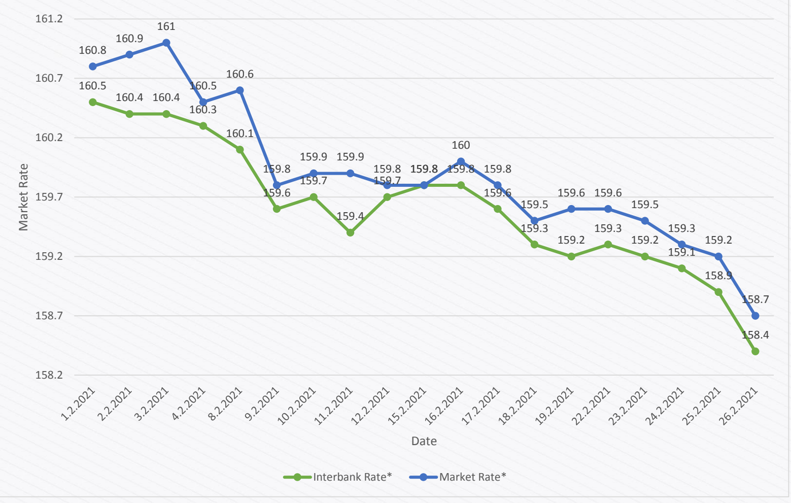
RUPEE-DOLLAR PARITY DURING FEBRUARY, 2021