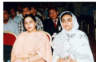
ICMAP members and professionals are listening to seminar proceedings.