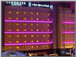
Land Mark Hotel (one night stay 4 star) Deria Dubai, 650/= AED