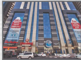
Latifa Tower Hotel (one night stay 4 star) Dubai, 750/= AED