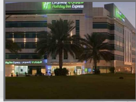
Holiday Inn Express Hotel (one night stay 4 star) Opp. Dubai Int'l Airport, 525/= AED