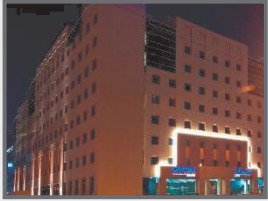
Citymax Hotels (one night stay 3 star) Bur Dubai, 500/= AED