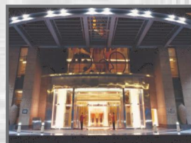
Shangri la Hotel (one night stay 5 star) Dubai, 625/= AED

* The participants may contact to the hotel directly for room reservations