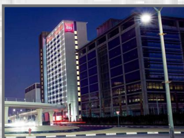
Ibis One Central Hotel (one night stay 3 star) Dubai, 550/= AED