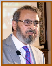
Mr. Saeed Ahmad Deputy Governor State Bank of Pakistan